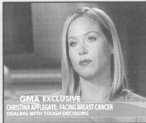
Christina Applegate got double mastectomy after cancer was found in one breast. She plans to have reconstructive surgery.